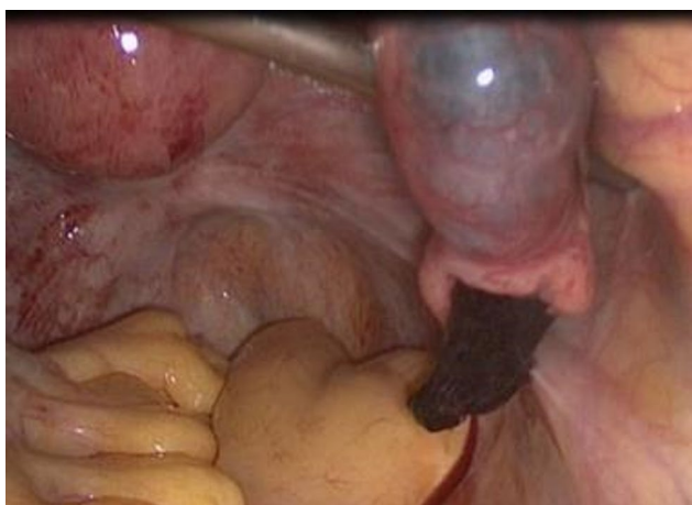
Figure 2. Right tubal ectopic pregnancy 33 days after embryo transfer

disorder of the event, patient chose not to perform IVF again. Nowadays patient opted for adoption and is currently satisfied with her decision.