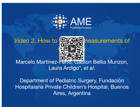
Figure 5 How to take the measurements of the thorax (15). Available online: http://www.asvide.com/articles/919