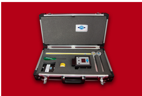
Figure 2 Briefcase containing the physician tool-kit (contents described in text).