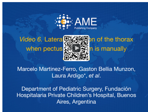
Figure 12 Lateral expansion of the thorax when pectus carinatum is manually corrected (19).

Available online: http://www.asvide.com/articles/927