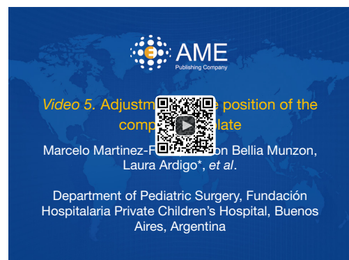
Figure 11 Adjustment of the position of the compression plate (18). Available online: http://www.asvide.com/articles/926

further investigation may be recommended.