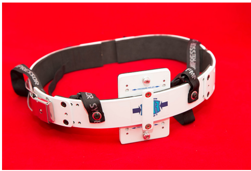
Figure 1 FMF® Dynamic Compressor System: aluminum brace with cushioned interior lining, side lock, adjustable shoulder straps and central compression plate.