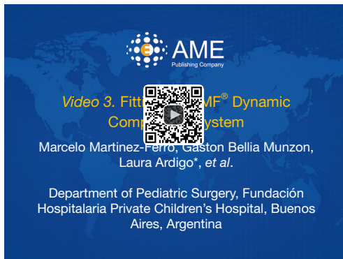
Figure 8 Fitting the FMF® Dynamic Compressor System (16). Available online: http://www.asvide.com/articles/924