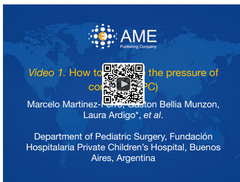
Figure 4 How to measure the pressure of correction (PC) (14). Available online: http://www.asvide.com/articles/916