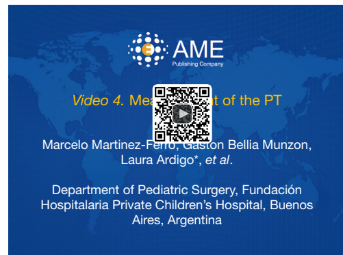
Figure 10 Measurement of the PT (17). PT, pressure of treatment. Available online: http://www.asvide.com/articles/925