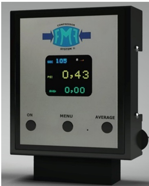
Figure 3 Pressure measuring device (PMD).