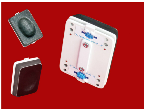
Figure 6 Contoured pad to maximize comfort (used in sharp-edged pectus carinatum) and compression plate showing the holes for docking the PMD. PMD, pressure measuring device.

patients who are good candidates for the FMF ® DCS from those who should be treated surgically.