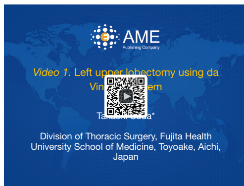
Figure 3 Left upper lobectomy using da Vinci Xi System (2). Available online: http://www.asvide.com/articles/1456

reported that there was a shorter learning curve for robotic surgery than for VATS. Considering that it is impossible to compare the transition of a surgeon who has performed thoracotomies to the first VATS with the transition of a surgeon who has mastered VATS to robotic surgery, it is difficult to compare VATS and robotic surgery. As with thoracotomy, robotic surgery allows a 3D view and also utilizes instruments with joints that mimic the joints of human fingers. Thus, it is expected that robotic surgery should have a shorter learning curve. However, as with VATS, both thoracotomy and robotic surgery involve unique surgical techniques that have to be mastered. On the basis of the available medical literature, a robotic lobectomy has a learning curve that extends over approximately 20 cases for a surgeon who has mastered VATS. However, in cases in which the surgeon has less than adequate experience with VATS, the learning curve will probably be longer.