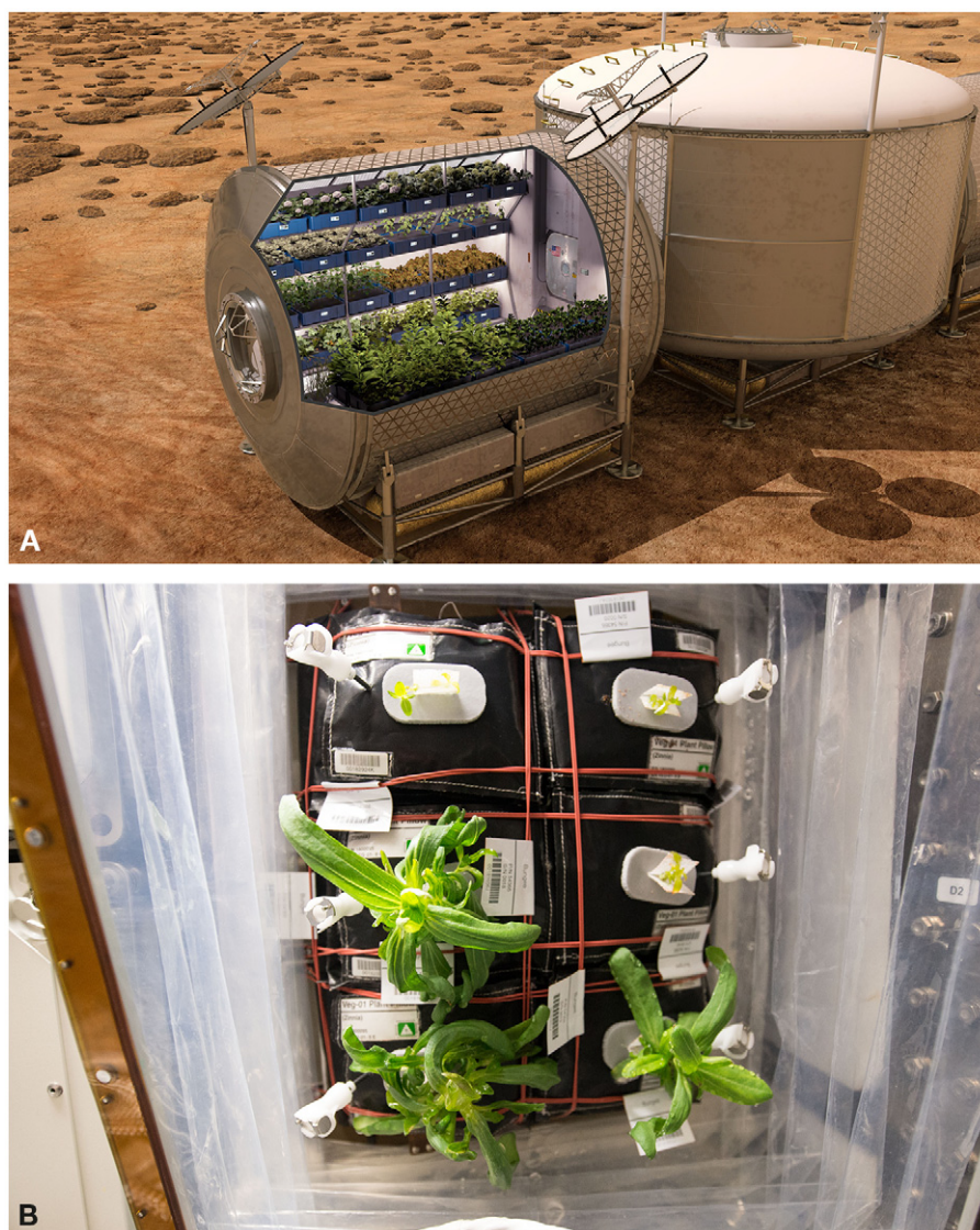
Figure 3. Fresh food grown in space.

(A) NASA plans to grow food on future spacecraft and on other planets as a food supplement for astronauts. Fresh foods, such as vegetables, provide essential vitamins and nutrients that will help enable sustainable deep space pioneering. (B) Zinnia flowers are starting to grow in the International Space Station's Veggie facility as part of the VEG-01 investigation. Veggie provides lighting and nutrient supply for plants in the form of a low-cost growth chamber and planting "pillows" to provide nutrients for the root system. These plants appear larger than their ground-based counterparts and scientists expect buds to form on the larger plants soon. The Veggie facility supports a variety of plant species that can be cultivated for educational outreach, fresh food and even recreation for crew members on long-duration missions. The facility has also grown lettuce, which was then consumed by the crew. Understanding how flowering plants grow in microgravity can be applied to growing other edible flowering plants, such as tomatoes.