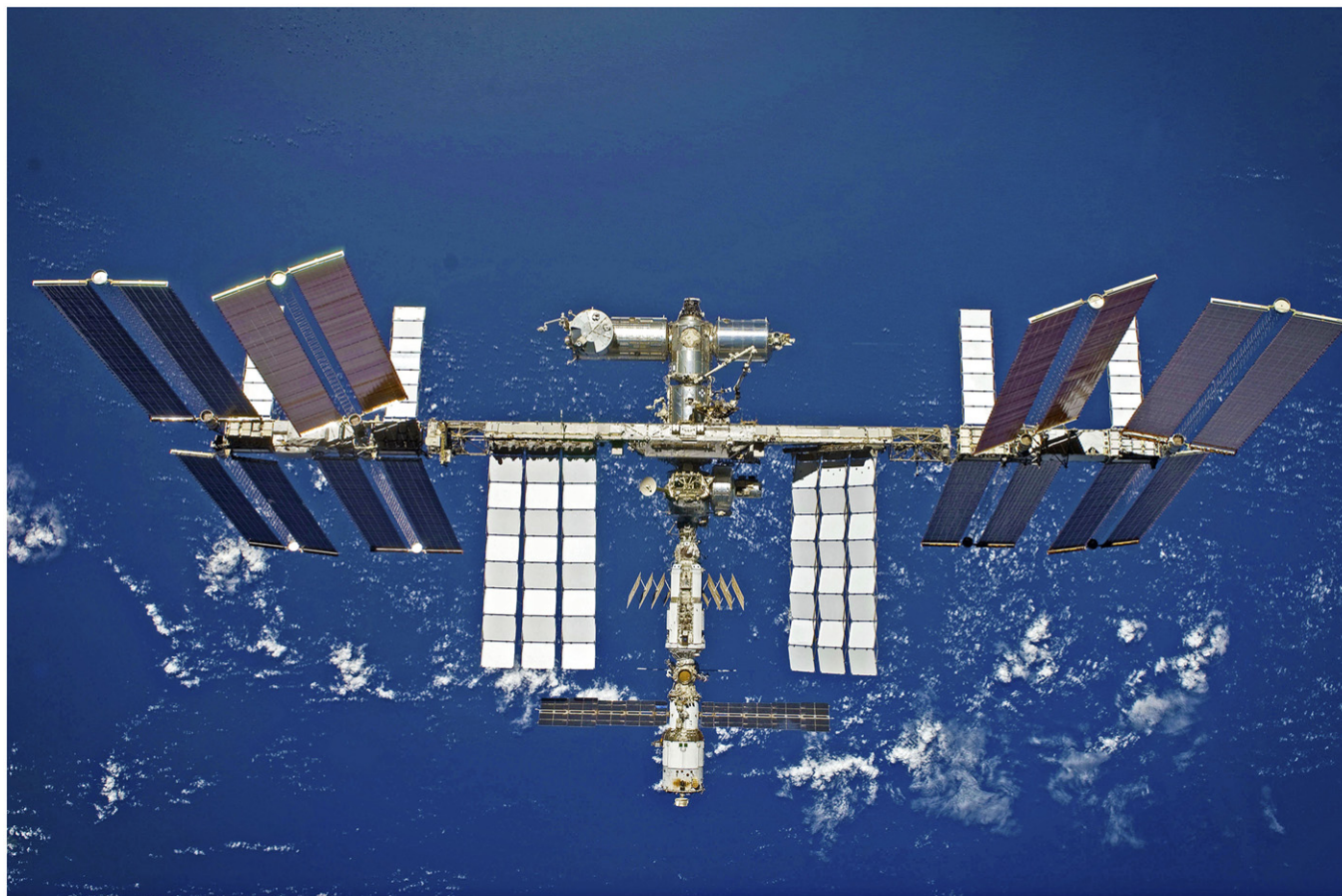
Figure 1. International Space Station.

First launched in 1998, and continuously inhabited since November 2000, ISS is a joint project among five participating space agencies: NASA, ESA, Canadian Space Agency, Russian Federal Space Agency (Roscosmos) and Japan Aerospace Exploration Agency (JAXA).