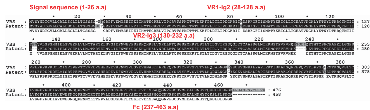
Figure 1 Sequence of two vascular endothelial growth factor-Traps (VEGF-Traps). VBS indicates the VEGF-Trap sequence used in the present study and Patent indicates VEGF-Trap-Eye (Aflibercept, Eylea) sequence from the patent (Regeneron). The discordance in sequences of the two proteins occurred within 5.3% (25 out of 476 amino acids). VBS is a sequence constructed by the laboratory named 'Vascular Biology and Stem Cell (VBS) laboratory' in the Korea Advanced Institute of Science and Technology (KAIST).

A total of 18 eyes were obtained from 18 healthy New Zealand white rabbits weighing 1.5–2 kg. The intraocular PK of intravitreally injected VEGF-Trap was assessed by the same experimental design used in our previous studies. 13,14 Briefly, the animals were anesthetized with an intramuscular injection of 15 mg/kg of Zoletil (a mixture of tiletamine hydrochloride and zolazepam hydrochloride; Virbac Laboratories, Carros, France) and 5 mg/kg of xylazine hydrochloride. Furthermore, topical