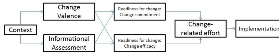
Figure 1. Theory of Organizational Readiness to Change