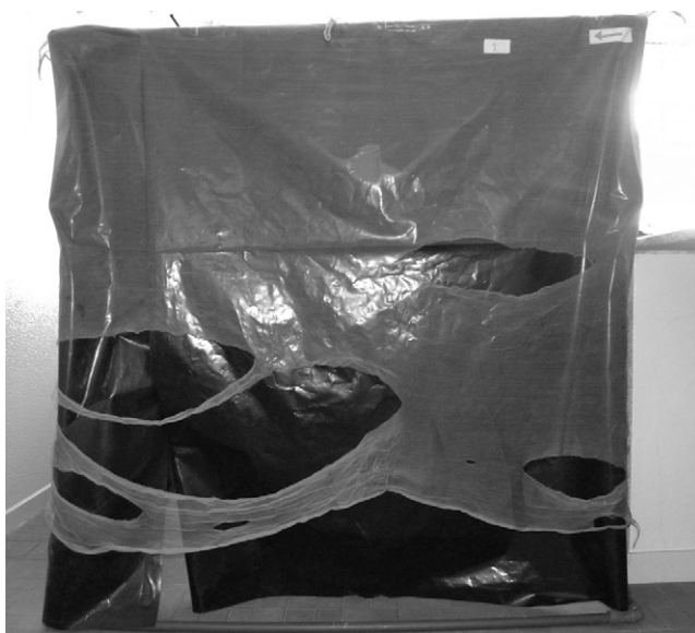
FIGURE 2. Example of collected used net over cube-shaped frame for hole counting and measurements in the laboratory.

LLIN inspection in the laboratory. We constructed cube-shaped frames of ~180 cm at the INS using commercial polyvinyl chloride (PVC) pipe and fittings and hung black plastic sheeting from the top rail to provide a contrasting background to facilitate the examination of the LLINs. The LLINs were removed from the plastic bags and carefully draped over the frame to avoid tears from placing the net over the frame (Figure 2). We assessed the physical integrity of the LLIN by