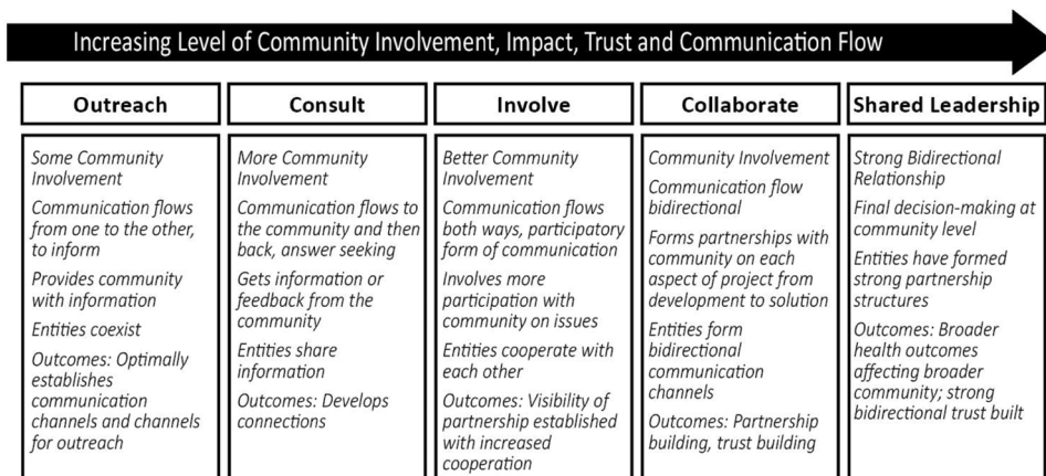
Figure 1. Community Engagement Continuum, developed by the Clinical and Translational Science Awards Consortium (2011).

The Outreach category applies to programs that provide information and services within the community (e.g., a trained health worker provides information to individuals and families at the household level). The Consult category applies to programs that share information with the community and solicit feedback. The Involve category applies to programs where communities and service providers cooperate with each other (e.g., involvement consists only of some role in the selection of the local community health workers/village health workers and/or the involvement of community members in some intervention activities). The Collaborate category applies to programs that form a partnership with the community on several aspects