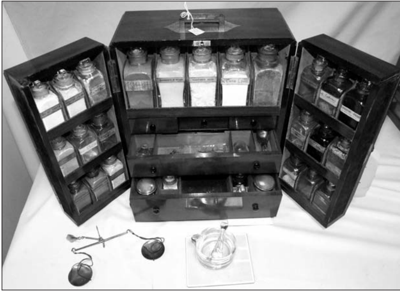
FIG. 3 Early-nineteenth-century family medicine chest. Maker unknown. Mahogany chest containing seventeen labeled flint glass jars, pestle and mortar, and pap bowl.

Since the late sixteenth century, alchemists, apothecaries in their shops, and itinerant practitioners had developed significant skills in the display and marketing of their commodities. They employed efficient strategies in pricing, packaging, product differentiation, novelty claims, brand names, trade routes and markets and fairs, and promotional skills in print.