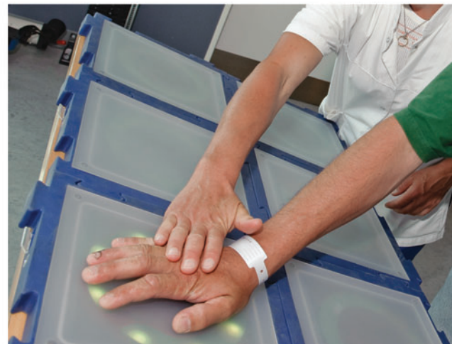
FIG. 1. The modular interactive tiles can be assembled in different configurations ( top left , top right , and bottom right ) for different playful exercises and levels.

modular interactive tiles once a week for 12 weeks. The senior community activity centers are organized so that most elderly individuals are transported to the centers from their private homes once or twice a week to engage in center activities for social interaction, and the elderly participants