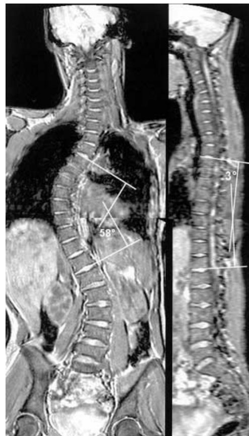
Fig. 2 MR total spine imaging in a 16-year-old patient with a coronal Cobb angle of 58^\circ and a sagittal Cobb angle (T4–T12) of -3^\circ (performed at first examination in our clinic; operative treatment is planned). The spine is remarkably straight in the sagittal plane; the lordosis extends from T6 to L1