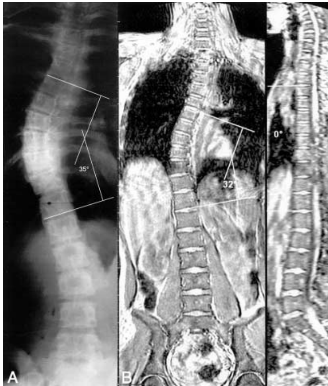
Fig. 1A,B A 15-year-old girl with right thoracic scoliosis and brace treatment. A Conventional radiograph with a coronal Cobb angle of 35^\circ . B Magnetic resonance (MR) total spine imaging with a coronal Cobb angle of 32^\circ . In the sagittal plane the thoracic lordosis is shown with a sagittal Cobb angle (T4–T12) of 0^\circ

In the group with idiopathic scoliosis, the mean Cobb angle was 28^\circ ( 10^\circ – 58^\circ ) for the thoracic curve on the coronal supine MR images. The conventional standing AP radiographs had an average Cobb angle of 33^\circ ( 12^\circ – 60^\circ ).