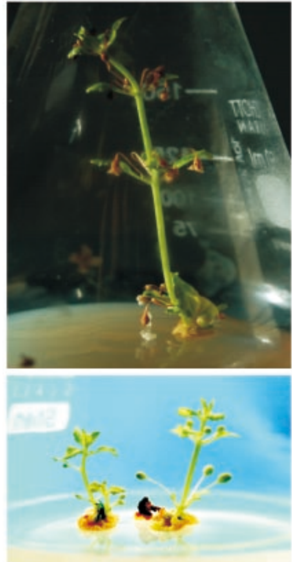
Figure 2. In vitro flowering of S. dulcis .

Regenerated shoots were used as explants for flowering induction. Flowering occurred when medium was supplemented with combination of cytokinins alone (BAP and KI) or with combination of auxins, CM and adenine sulfate (Data are not shown here). Flowering was not uniform in each trial. Flowering failed when medium was fortified with any one of the cytokinins at different concentration (KI or BAP) along and auxin alone. In the present study on flowering, the explant did not sprout and the base of the explants produced the callus and flowering occurred after 7 days (Figure 2).