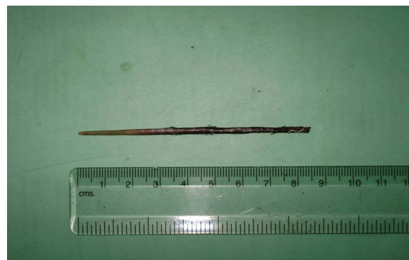
Figure 3 A long and stout feather with a pointed tip of approximately 8.5 cm.

cause evident peritonitis, localised abscess formation, enterovesical fistula, intestinal obstruction and intestinal haemorrhage. 5–9