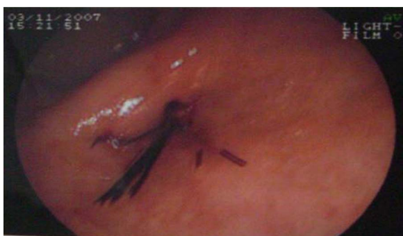
Figure 2 The duodenum after removal of the foreign body.

Most ingested foreign bodies pass through the GI tract uneventfully within 1 week. Cricopharyngeal sphincter, constrictions of the oesophagus, distal ileum and ileocaecal junction are the normal anatomical sites of foreign body impaction. 2 The pathological areas such as oesophageal rings or webs, pyloric stenosis, intestinal stricture and congenital malformations are the other areas of impaction. Impacted foreign bodies may