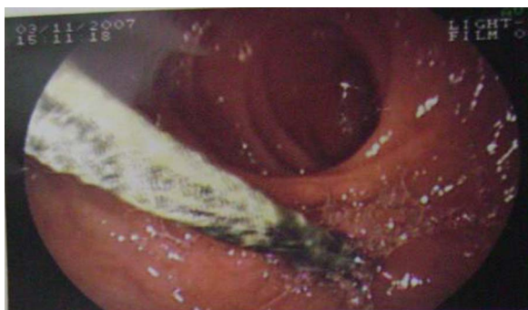
Figure 1 A feather in the first part of the duodenum in the upper gastrointestinal endoscopy.

discharged and was advised for a routine upper GI endoscopy. A feather penetrating the first part of the duodenum was visible with a visible scar surrounding it (figure 1). A second follow-up with an upper GI endoscopy was 1 month after the endoscopic removal of the feather which revealed a normal duodenum without any pathological conditions (figure 4).