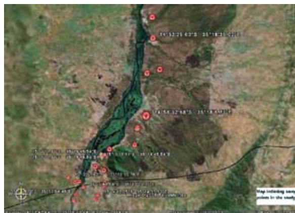
Figure 1: Satellite map showing sampling points in study area.