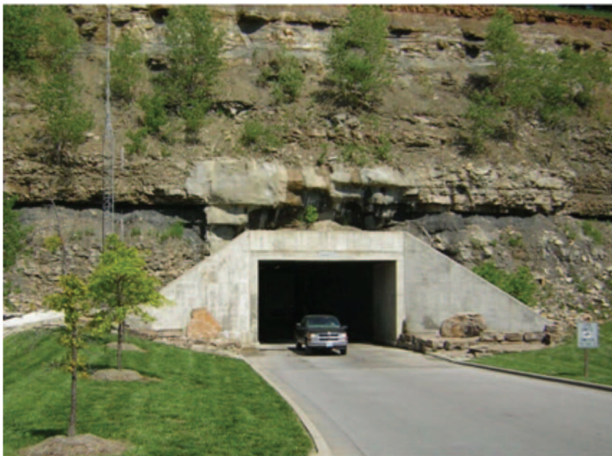
FIGURE 5. The entrance to the Lenexa, Kansas, Federal Records Center. (Color figure available online.)