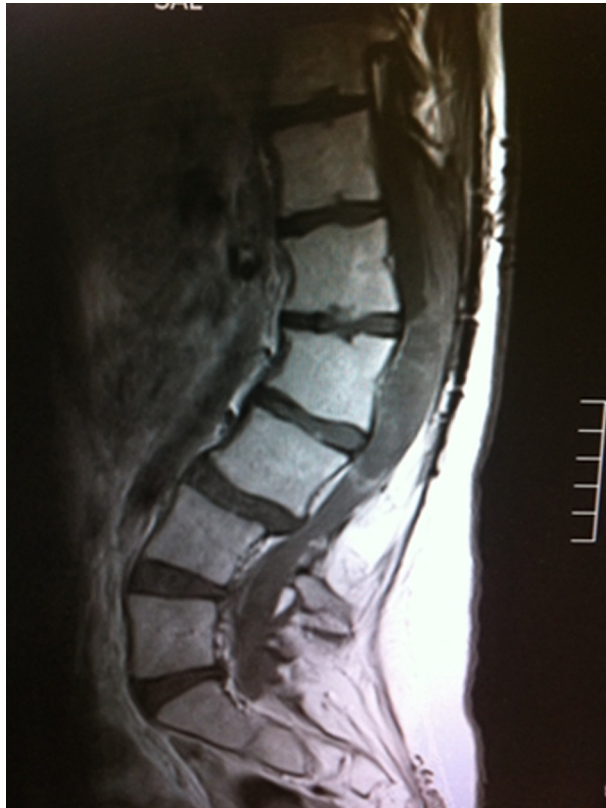
Figure 1 Sagittal MRI T1 weighted imaging of the lumbar spine demonstrating the isointense signal to cerebrospinal fluid.

underwent an MRI, which showed a cyst recurrence with an increase in the size to 5 cm. Subsequently, a re-exploration of conus medullaris was performed with radical evacuation of the cyst. Surgical intervention led to good