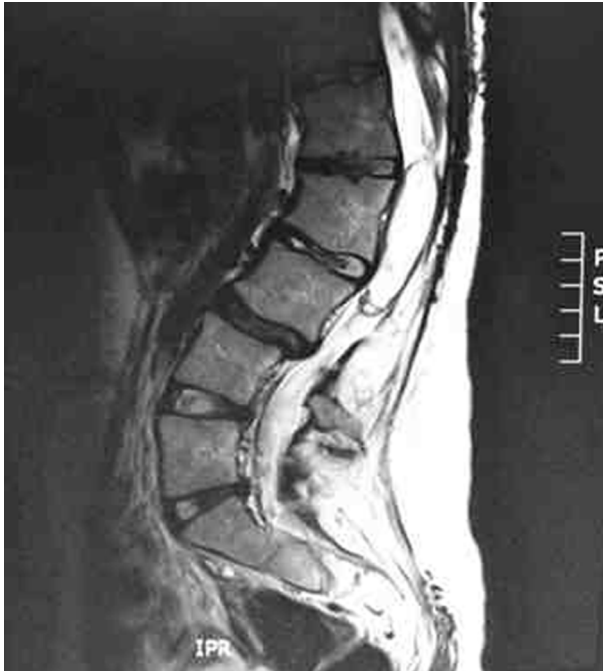
Figure 3 Sagittal T2 weighted MRI demonstrating high signal in the conus medullaris and previous laminectomy defect and scar tissue.

The table 1 below summarises the treatment offered to the patient with indications and outcome.