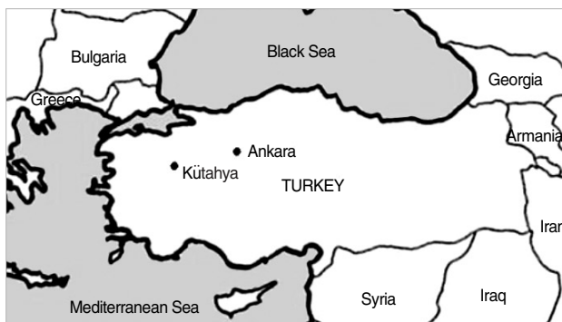
Fig. 1. A map showing the city of Kutahya in Turkey.

Sera that had been tested for presence of HDM sensitization were kept for SM sensitization studies in sterilized 1 ml tubes with eppendorf tubes at -86°C deep freezer (Revco). At a later stage, these samples were defrosted once and centrifuged to be made ready for the new testing. In the tests, specific IgE for A. siro , G. domesticus , T. putrescentiae , and L. destructor were searched in sera of 92 children; 41 of them were found previously to have specific IgE against at least 1 of D. pteronyssinus and D. farinae antigens, while the remaining 51 children were found negative.