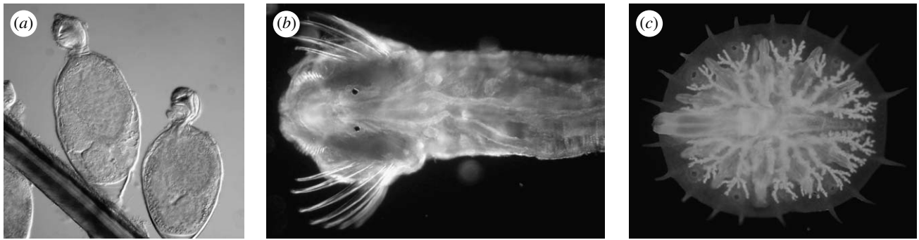
Figure 2. Some extant ‘problematica’—lophotrochozoan representatives of (a) Cyclophora ( Symbion americanus), (b) Chaetognatha (unidentified species from Bocas del Toro, Panama) and (c) Myzostomida ( Myzostoma cirriferum). The position of these taxa is highly controversial and awaiting new data and novel approaches to understanding their morphology and phylogenetic position.

organs are present in groups such as nematodes, tardigrades and arthropods, and several other groups lack these organs entirely.