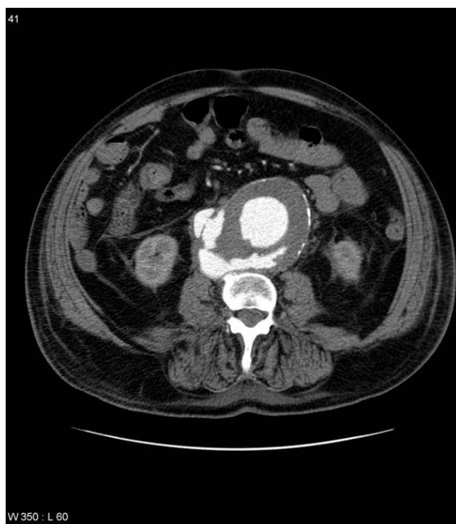
Figure 3 Selected axial MDCT slice at a lower level shows an infrarenal AAA with fistulous communication with the IVC. Note the absence of the normal fat plane between the aorta and IVC.