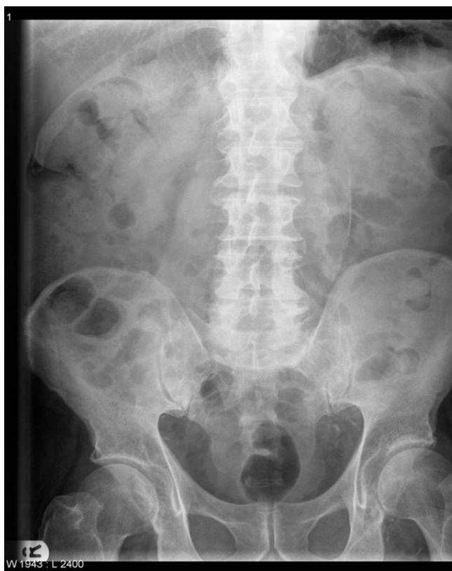
Figure 1 AXR shows curvilinear calcification in wall of AAA. The psoas shadow is preserved.

The preoperative diagnosis of aortocaval fistula improves morbidity and mortality by allowing appropriate anaesthetic and surgical planning. It is important for the anaesthetist to administer IV fluids judiciously and to avoid intra-operative fluid overload that would exacerbate pre-existing heart failure. Patients are prone to acute cardiac decompensation particularly at the time of aortic cross-clamping and fistula closure. Pre-operative diagnosis allows the surgeon to plan the approach to repair, and to apply a meticulous technique that amongst other things does not dislodge thrombus into the IVC to cause pulmonary embolism.