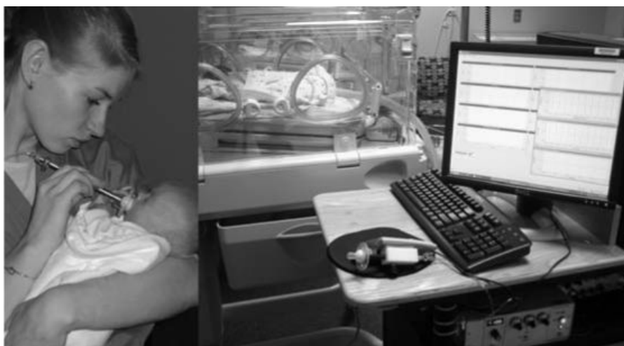
Figure 1. (left) Infant is treated with the NTrainer© patterned orocutaneous therapy. (right) The NTrainer© device is wheeled cribside in the Neonatal Intensive Care Unit (NICU).