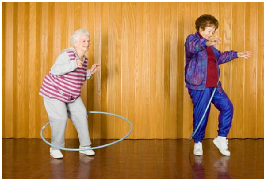
Exercising can help prevent falls

Thus, preventing falls is a logical approach to preventing fracture, but can falls be prevented? Evidence from systematic reviews and meta-analyses of randomised trials shows that at least 15% of falls in older people can be prevented, with individual trials reporting reductions of up to 50%. 6 23 The randomised trials used either a single intervention strategy (such as exercise) or multifactorial preventive programmes that included simultaneous assessment and reduction of predisposing and situational risk factors. Scientific evidence is most consistent for